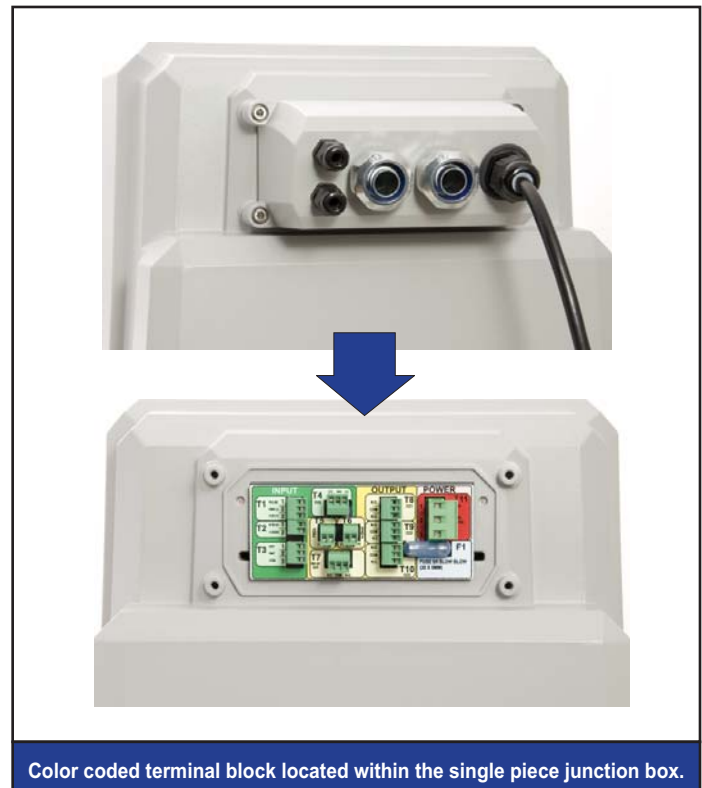
Color coded terminal block located within the single piece junction box.

* Requires Micro-Flo Sensor sold separately